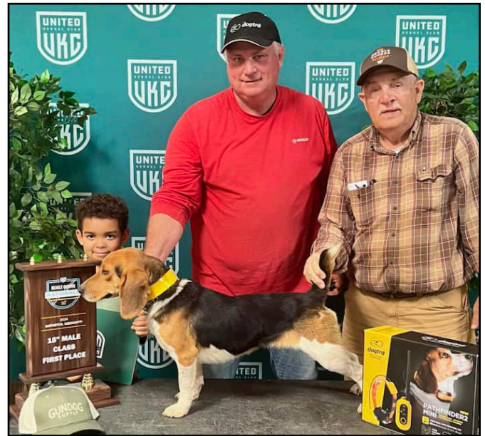
CHAMPION Lonestar Dougie, Jackie Brown, (FCGD Rapid Run Big Blue Boogie X FCH FCGD Double B's Ain't Yo Wanda)